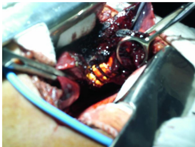
Figure 3 Intra-operative finding. Intra-operative photograph depicts the AM-403/P attenuated energy projectile within the lung parenchyma during wedge resection.

ing fatalities [4]. There are many classes of "less lethal weapons" including conducted electrical weapons (commonly referred to as a TASER), chemical irritants (Pepper spray), and impact munitions. Impact munitions include "bean bag rounds", rubber bullets, plastic baton rounds, and attenuated energy projectile. As our case is an example of a serious injury caused by a rubber bullet, we focused our literature review on chest injuries caused by rubber and plastic "less lethal" munitions from 1972 to 2008 (Table 1).