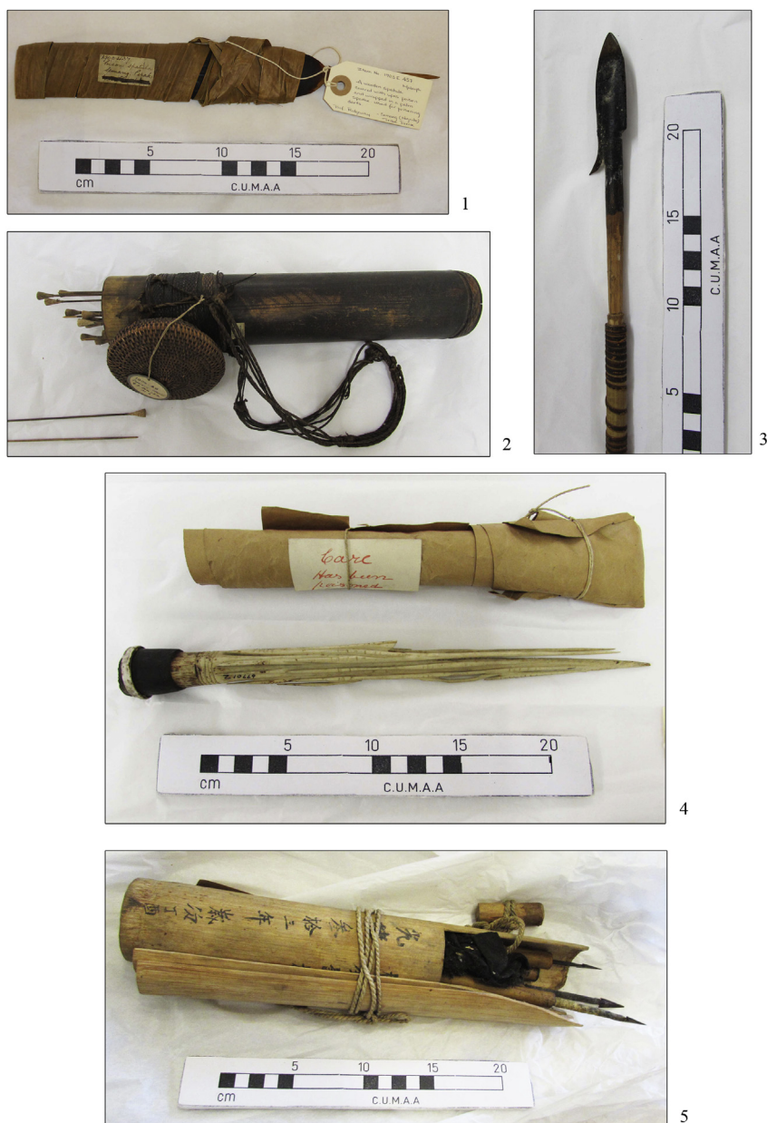
FIGURE 1.2 Various poisoned weapons at the Museum of Archaeology and Anthropology, University of Cambridge, analyzed within the project of Borgia et al. (2016). 1—Spatula covered with poison from Malaysia; 2—Quiver with darts from Borneo; 3—Single barbed iron arrow from Malaysia; 4—spearhead from Samoa with label "Care has been poisoned"; 5—Spatula for poison and iron arrowheads for crossbow China.