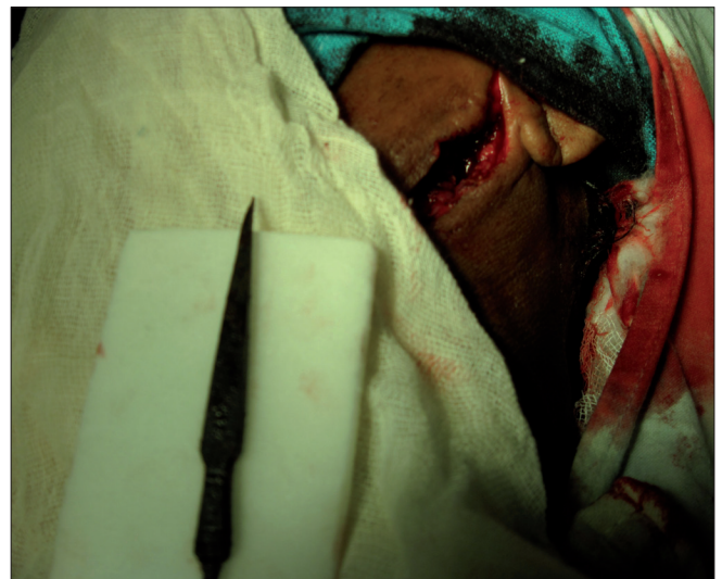
Figure 4: Arrowhead after retrieval

Arrow wounds are very rare in western countries, but they are still prevalent in the Indian tribal population. [1] Most commonly, arrow injuries are seen over the chest and abdomen, but are less common in the head and neck region. While retained foreign